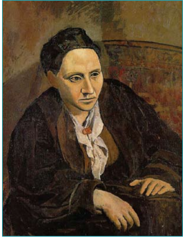
Portrait of Gertrude Stein, 1906 Pablo Picasso